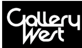
EXHIBIT SPACE FOR RENT at Gallery West

Gallery West is happy to announce the availability of exhibit space for rent within the gallery at 1213 King Street. The rear portion of the upstairs floor will be available for rent for a month at the rate of $300 for the entire rear portion or $150 for the left wall or $175 for the combination of the rear and right walls. There will be a commission of 40% on any sales. An artist who rents space will be able to hold a small reception if they wish with the requirement that the reception be during normal business hours and not conflict with other activities at the gallery. If interested please contact Jeff Evans at jefferson.evans@uspto.gov and/or 703-869-1682.