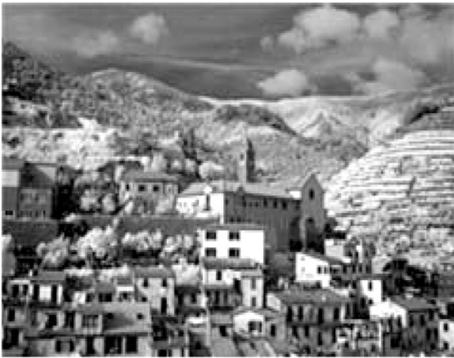
"Cinque Terra" Infrared

Phone: 703-549-6006 or Email: GalleryWest@verizon.net .