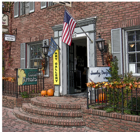
309 Mill Street, Occoquan, VA

The Artists' Undertaking Gallery in Occoquan, VA is looking for new artists to join a very successful cooperative gallery that has been in operation since 1977. The gallery is open seven days a week, with artist members working one day every other week. The gallery takes no commissions from sales.