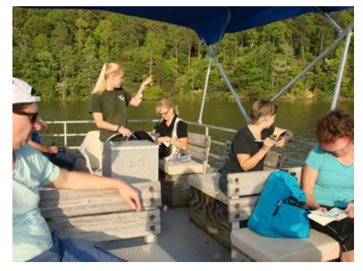
Sketching During Boat Ride on Lake Accotink

Our June 26 group found what we think was a woodpecker condo with perfectly round doorways to their little apartments, a delicate white wildflower growing throughout the woods (working on an ID), a Mimosa Tree (not native but gorgeous and so fragrant), dragonflies (including one that looked like crystal in the sunlight) and so much more. The spot where we settled has small pine trees that are visited by hummingbirds, and we were thrilled to see one feeding. At one point, it flew down through our group as if checking us out.