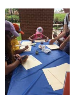
Children having fun writing with quill pens