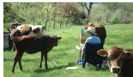
A few cows critiquing Mary's work, including one who decided to photobomb the pic!

http://artid.com/members/maryexline/blog/post/15362-my-journey-through-art