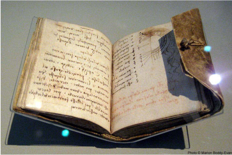
A notebook belonging to Leonardo da Vinci (Codex Forster III) from 1490-3 In the collection of the V&A Museum in London.

American oil tycoon Armand Hammer pays $5,126,000 at auction for a notebook containing writings by the legendary artist Leonardo da Vinci.