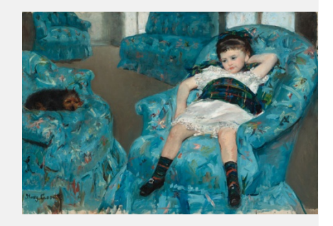
Degas/Cassatt May 11 – October 5, 2014

Celebrating Van Gogh at the National Gallery of Art June 8 – September 18, 2014