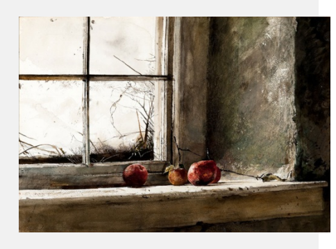
Andrew Wyeth: Looking Out, Looking In May 4 – November 30, 2014