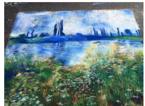
This was the Winner