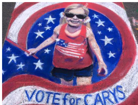
This was the Artists' Choice winner