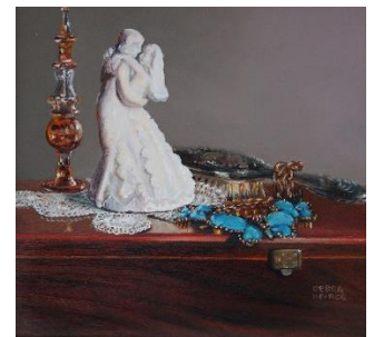
"Something Borrowed Something Blue" - Oil - 5x5"