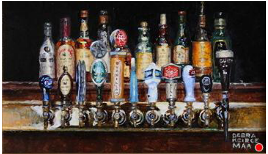
"Vanilla" - Acrylic - 2.5"x4"

To see more of Debra's miniature paintings - click here To learn more about Debra and her art visit http://debkart.com/