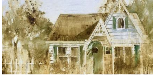
Bathe provides a step-by-step demonstration of her painting “Pipkas Cottage” using water-mixable oils.