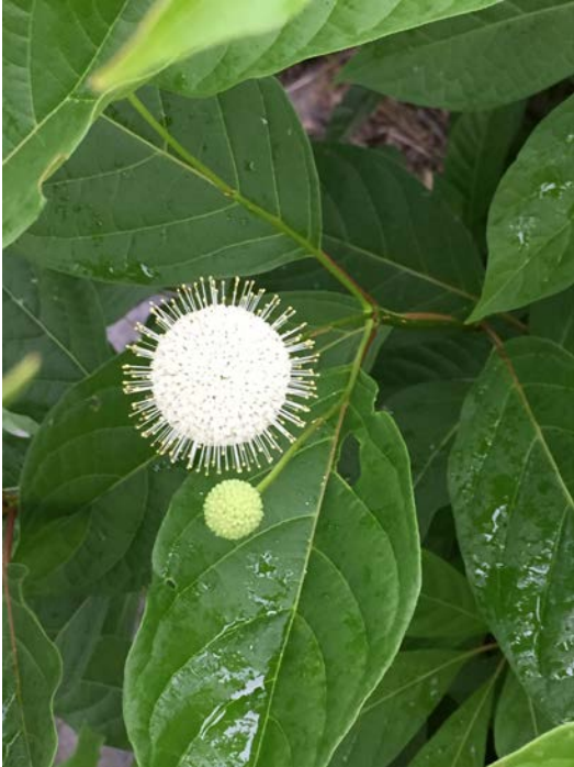
Photo of a Buttonbush bloom