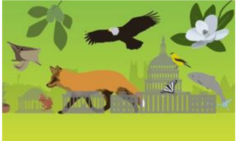
Official Art for City Nature Challenge DC 2021 (use approved for educational purposes)

Wearing my Fairfax Master Naturalist hat, I will be working with Lake Accotink Park Management to organize at least one City Nature Challenge DC hike (April 30-May 3) to observe and photograph the park's plants and wildlife, using cell phones and the iNaturalist app. Exact dates for the walk are pending approval. Either at the park or on Zoom, we also will have a fun nature journaling session to create a sketchbook page about our experience. Stay tuned!!!! Visit this official site for more information: https://citynaturechallengedc.org .