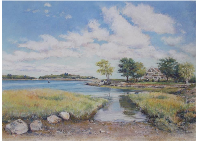
"The Summer Place" pastel painting

What's happening with SAG in 2021? The board is busy coming up with new ideas and activities for our members!!!