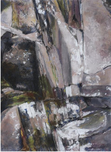
"Hidden in the Layers" just juried into the Art League's Sept Show and sold!