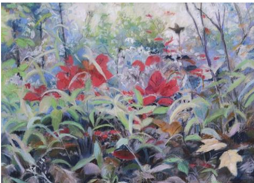
"Small Wonders" pastel painting