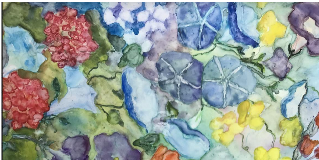
"Glorious Garden" by Carrie Cole

The Franconia Government Center Show is happening! You can enter up to 4 pieces of your work – no entry fee, no theme, artist choice. It's a great show, but there is a quick turnaround.