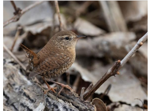
Winter Wren; photo: Therese Scheller/Audubon Photoaraphu Awards

Sat. Feb 4, 11 & 18 – 9:30-11:30am- Drawing Weather and Skies (adults age 16 and up) $60 Code: 22N.19UM