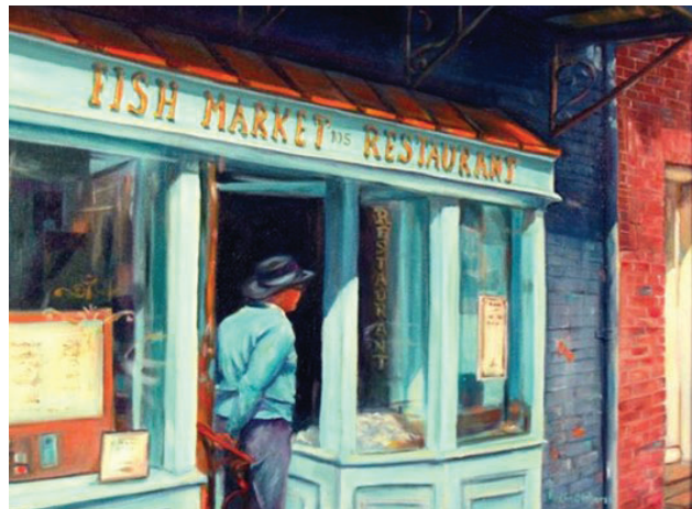
1st Place Fish Market LYDIA JECHOREK