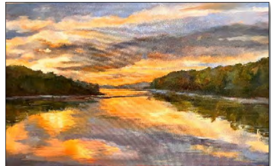
Sunrise on the Occoquan. 18x24" oil

313 Mill Street (upstairs), Occoquan, VA. Tue-Fri 11am-4pm, Sat 11 am-5pm, Sun Noon-5pm